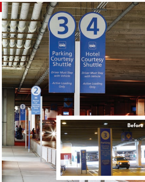
New freestanding signs along curbs near baggage claim areas identify zone assignments for various ground transportation services. A single-post design and ample clearance allow pedestrians to walk underneath. Previous double-post signs blocked more of the sidewalk.

Like many airports, PHL had a history of simply adding more signs, he explains. Eventually, the signs accumulate and create visual clutter that actually complicates wayfinding. McCartney refers to the common kneejerk reaction as sign-a-holic syndrome. "This is where wayfinding complaints are addressed