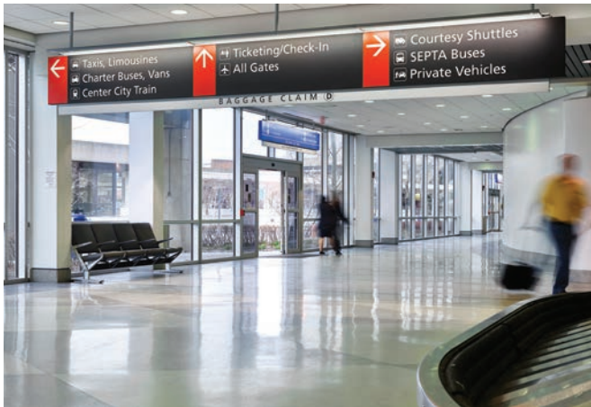
New overhead directional signs in baggage claim areas direct passengers to ground transportation options outside.

by adding yet another sign,” he explains. “Eventually, you’re so saturated with signs that you lose the messaging on any of them.”