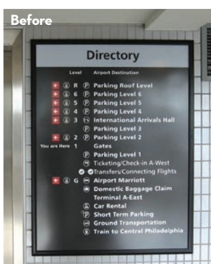
New elevator directories in the garage are designed to show the relationship between garage levels and terminal levels, which do not correspond one-to-one.