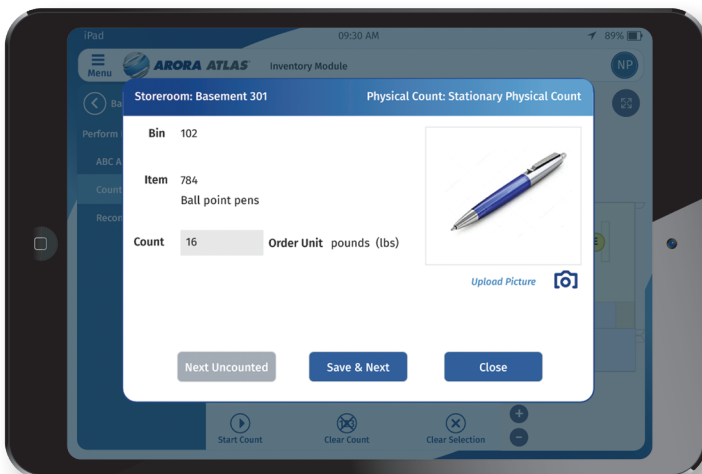
▲ ATLAS Supply Count Book Screen