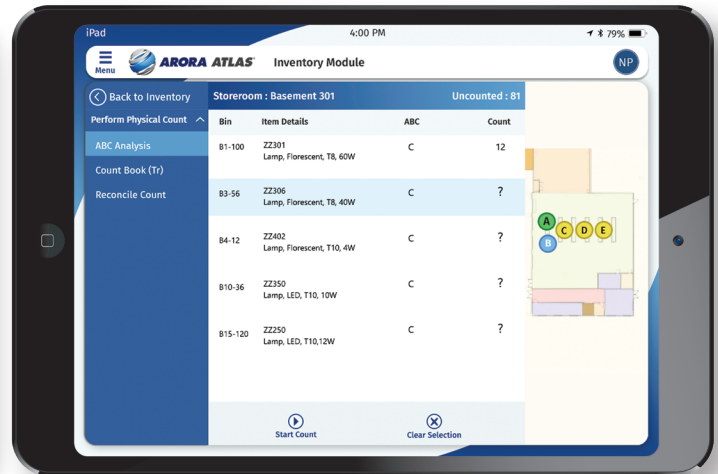
▲ ATLAS Supply Analysis Capability