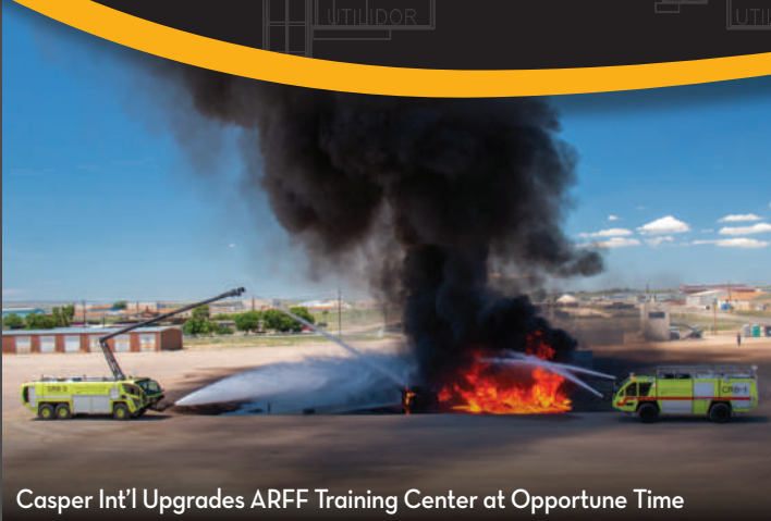
Casper Int'l Upgrades ARFF Training Center at Opportune Time