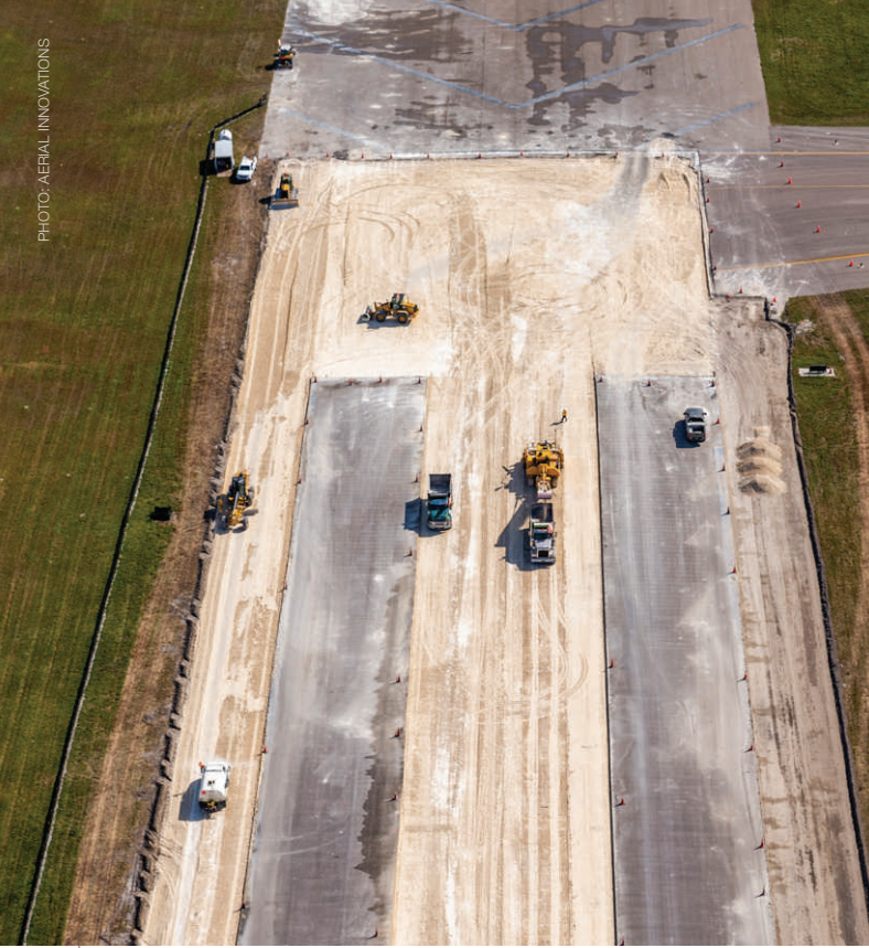
A temporary lull in traffic due to COVID-19 made last spring an ideal time to perform runway work.

“In Florida, oxidation and sunshine deteriorates pavement faster,” Sprague explains.