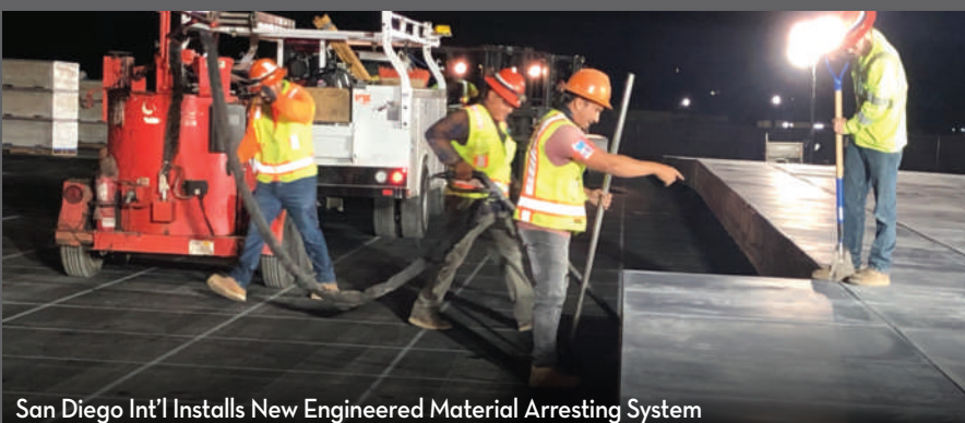
San Diego Int'l Installs New Engineered Material Arresting System

AIRPORT STORIES INSIDE: AVP | CPR | DAB | DFW | HIF | HNB | MDT | ORD | PIE | RDM | SAN | TYS | YMM