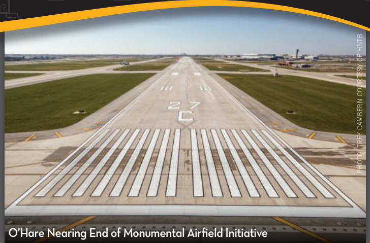
O'Hare Nearing End of Monumental Airfield Initiative