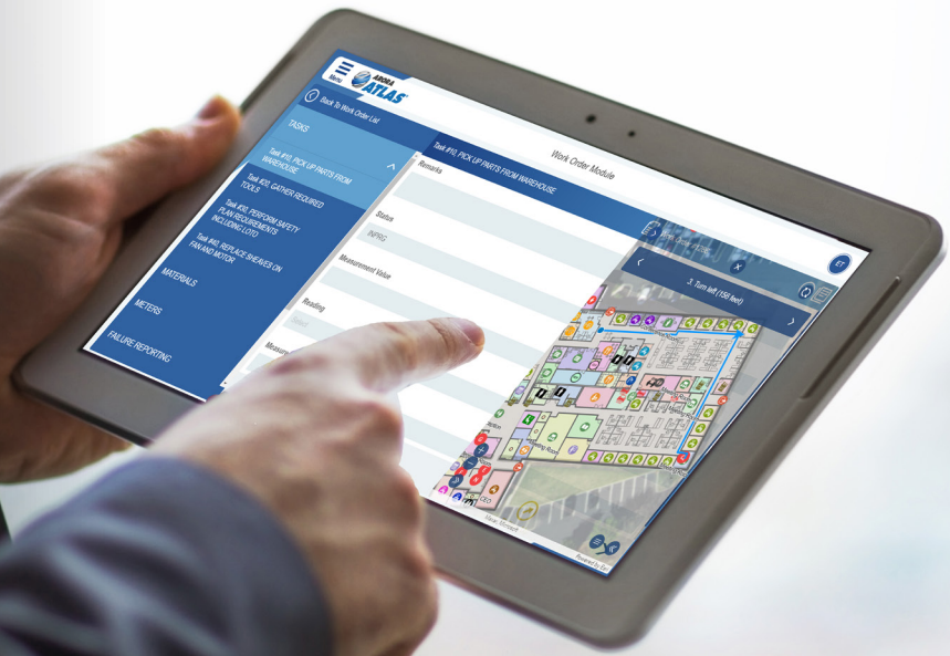
▲ Effortless Indoor Navigation at Your Fingertips

Arora ATLAS® Indoor Maps offers a powerful solution for seamless asset management and indoor navigation. Streamline workflows, optimize resources, and enhance user experiences within complex indoor environments.