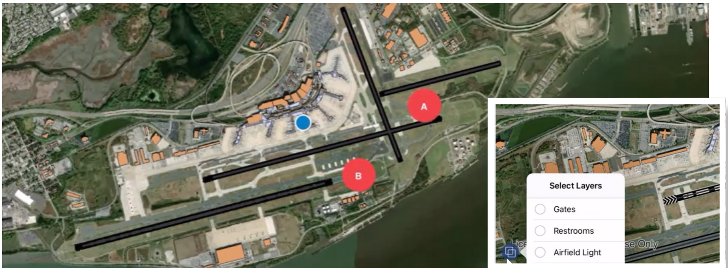
▲ ATLAS Fix Expanded Map View